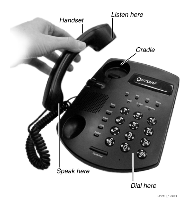
Figure 1. Telephone showing relevant user features

Refer to Figure 1 to obtain a better understanding of the various parts of your telephone. If your installation includes a telephone from QUALCOMM, the diagram should match your telephone. If you elected to purchase your own telephone, the features labeled in this diagram may appear differently, depending on the particular model.